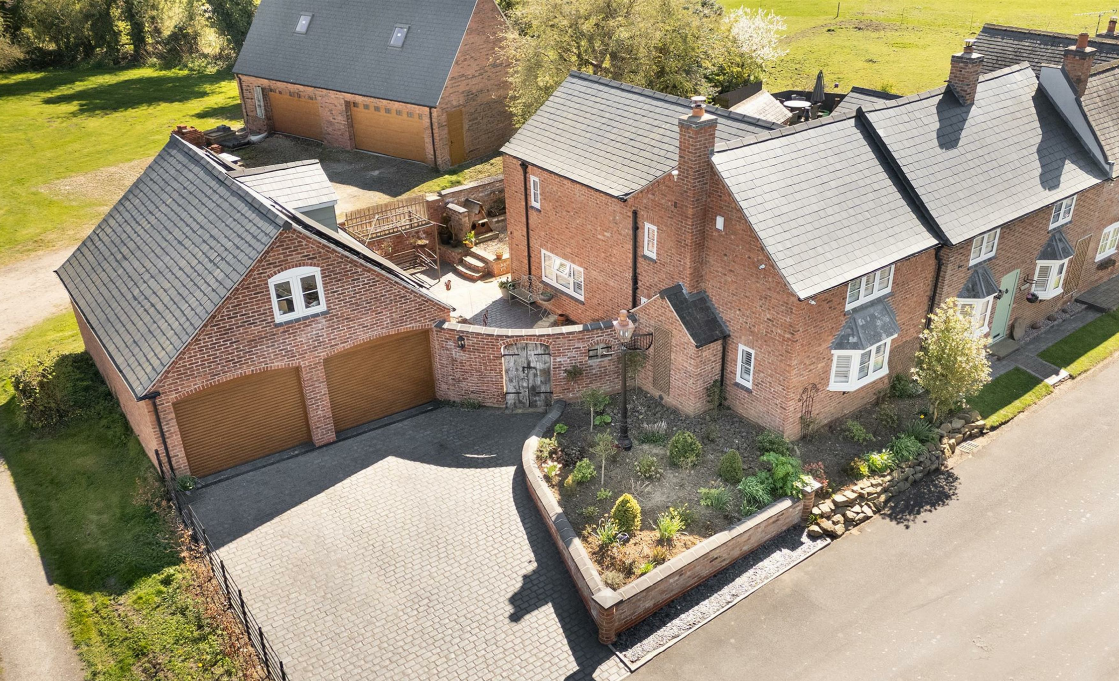
Main Street Peatling Magna LE8 5UQ