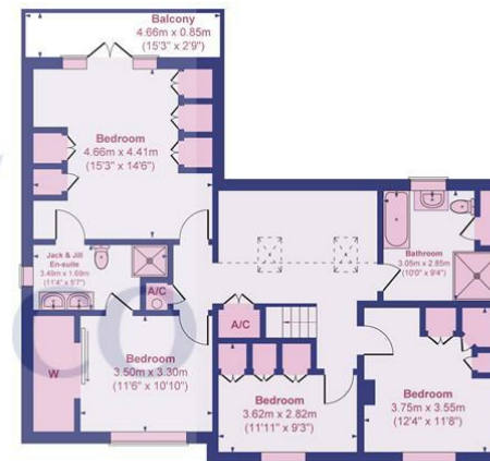
First Floor Floor area 94.4 sq. m. (1016 sq. ft.) approx

Not to scale for layout reference only. All Measurements are Approximate Produced by As built Energy Surveys for Andrew Granger & Co orders@asbuiltenergysurveys.co.uk