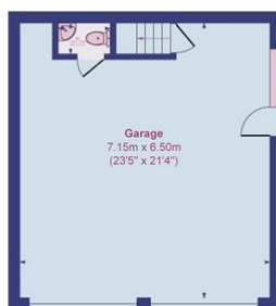
Garage Ground Floor

Approximate Gross Internal Area 204.3 sq. m. (2199 sq. ft.) Garage At 75.9 sq. m. (817 sq. ft.) Total 280.2 sq. m. (3016 sq. ft.)