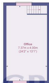
Garage First Floor